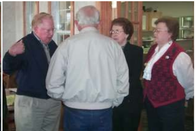
You Do It This Way