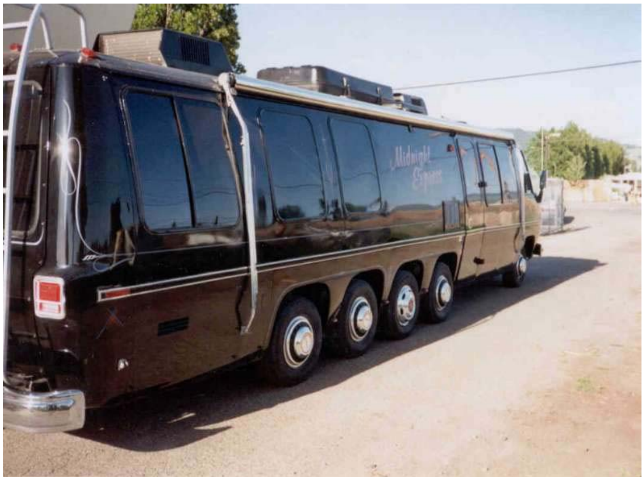
The Midnight Express