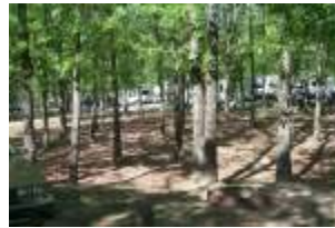
What a View!