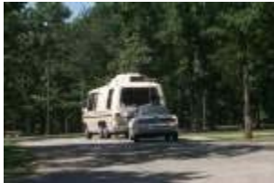
Whoa, Black Bart!