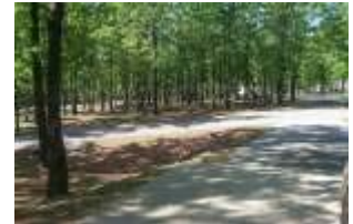
God's Special Creation