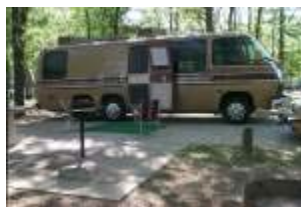
Bring Out the Pepsi, Please