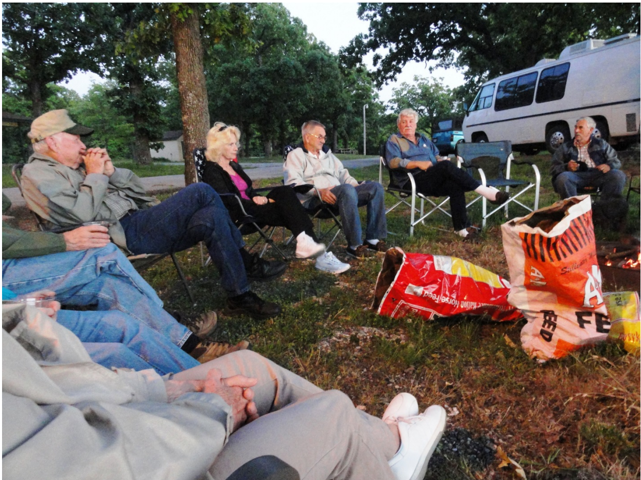
Lunch Bunch Leisure Time