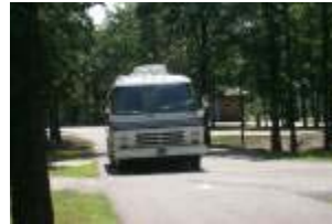
A Hero's Welcome