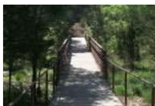
Bridge Over Falls