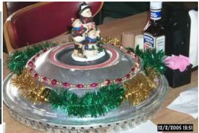
GMC Table Decorations