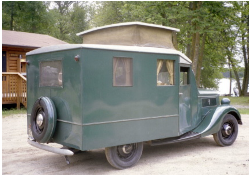
1937 House Car