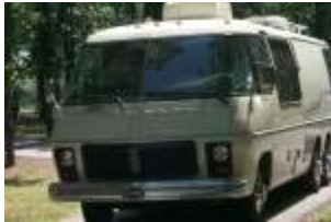
Big Bad Bill