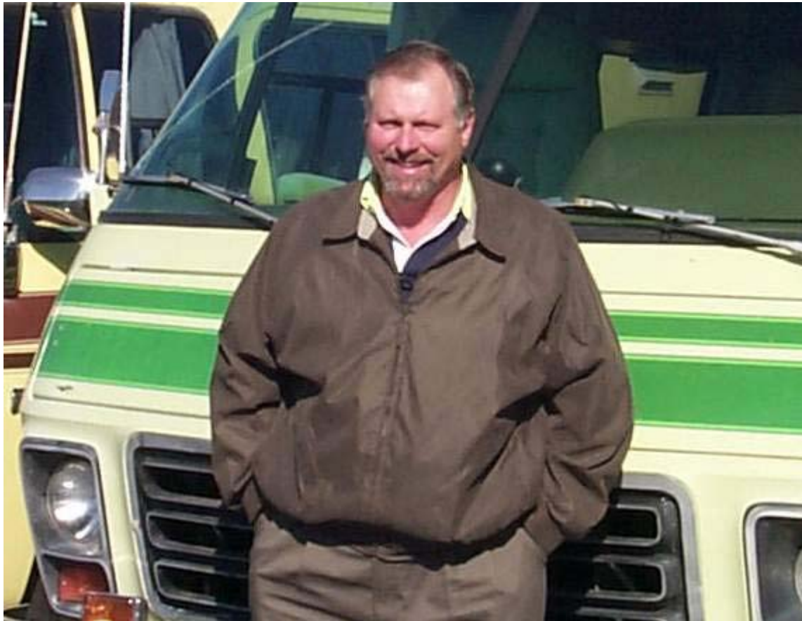
1975 Palm Beach