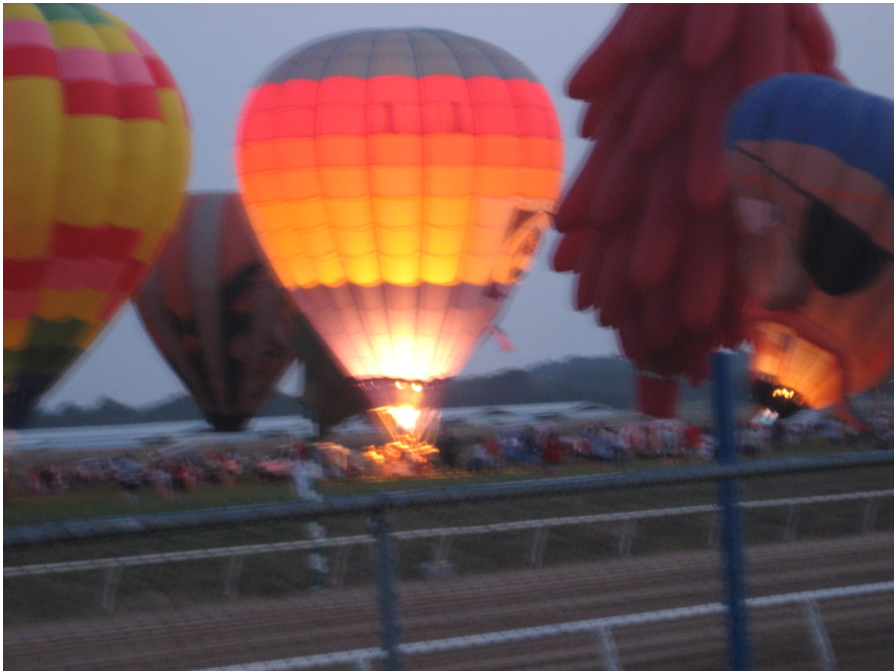
Gatesway Balloon Festival