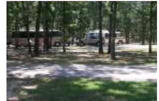
Really Roughing It