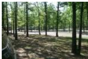
A Wonderful Retreat