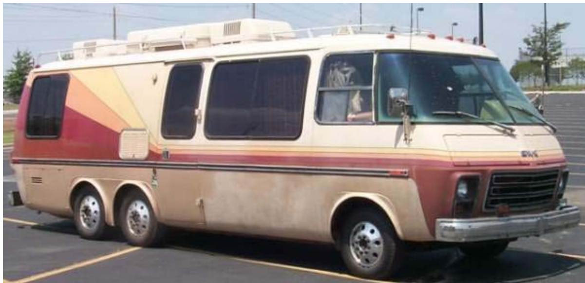
The Georgia Peach