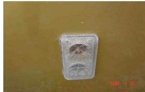
Screen for Furnace Exhaust and Inlet Air

Richard Hodges strongly suggested installing mud dauber screens on the air inlet and exhaust outlets of the furnaces. They are especially necessary for coaches that are used infrequently and not garaged.