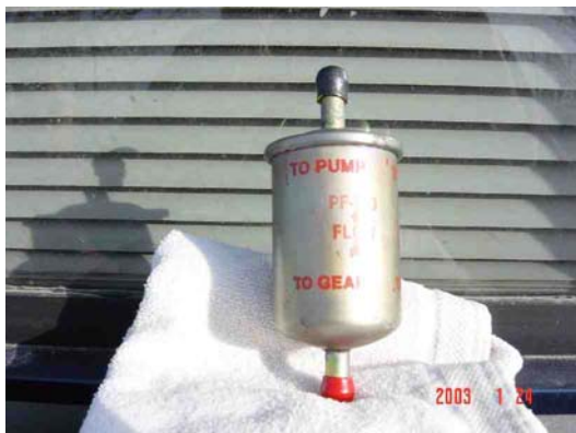
Filter for Power Steering System

Doran Jones, in response to a question about the need to remove and replace power steering fluid, suggested using a filter in the fluid circuit. It should be installed on the low-pressure side. He uses an AC filter, AC part number PF883; in July 2000, the price was about $10. The filter traps debris that may damage power steering components and plug the windshield wiper filter.