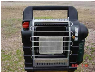
"Mr. Heater" – front

Dale Opland showed a gas-fired portable heater rated at a maximum of 9000 BTU/hour input (compared to about 5100 BTU/hour for a 1500 watt electric heater). The heater uses propane canisters and is safe for indoor use. One canister will fuel the heater for about 12 hours when firing at the maximum rate. The cost of the heater, "Mr. Heater" Model MH 9B, is about $70 at Tractor Supply stores. Several owners who were experiencing on-board furnace problems bought them and reported good results. Here are pics: