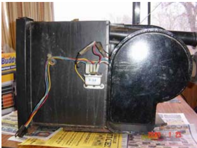
Suburban Furnace (early) – right side