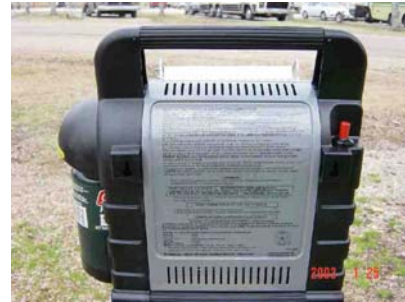
"Mr. Heater" - back

Several owners reported that they had replaced the OEM furnaces. Representative over-the-counter cost was about $600 for furnaces with ratings similar to the OEM furnaces. Installed cost was as much as $1100 where the replacement was not a direct "drop-in". Several owners noted that RV service centers will generally attempt to sell a replacement furnace rather than service an existing furnace, especially if it is original equipment.