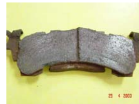
Close-up of Pad