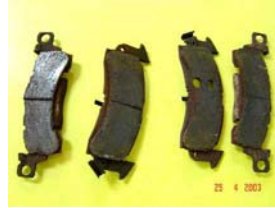
Badly Deteriorated Pads