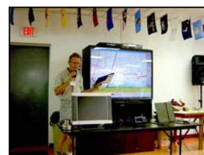
Illustration using Projection TV

Here are a few digital pictures from Larry's presentation.