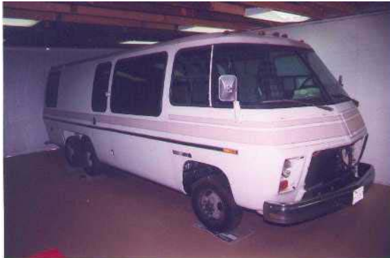
Core Coach: 1976 26' Transmode