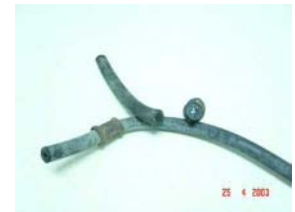
Brake Hose Completely Closed